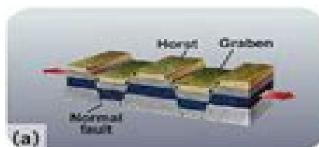
(a) Illustration of diverging plates