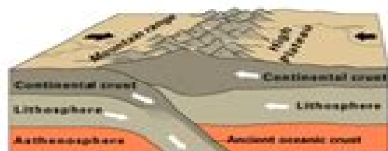
Continental-continental convergence Illustration of converging plates

Diverging sounds like dividing, which means to separate, so diverging plates separate from each other.