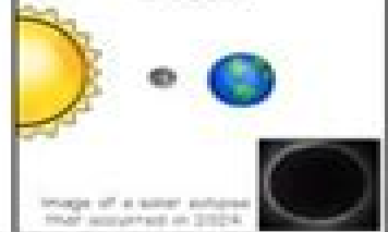
Image of a solar eclipse that occurred in 2024.

A solar eclipse happens when the moon moves between the Sun and the Earth.