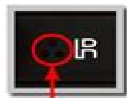
Remote Control Receiver

You can turn on or off the unit by Infrared remote control, Start /Pause/Next/Up in Playback mode, auto search and store the stations in radio mode, turn up/down volume.