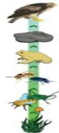
Figure 1. Food chain