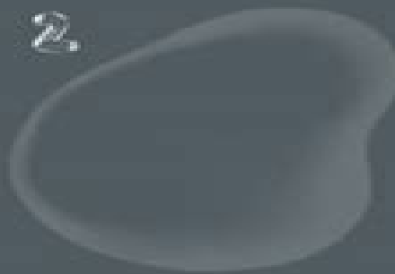
Usage background color to open transparency