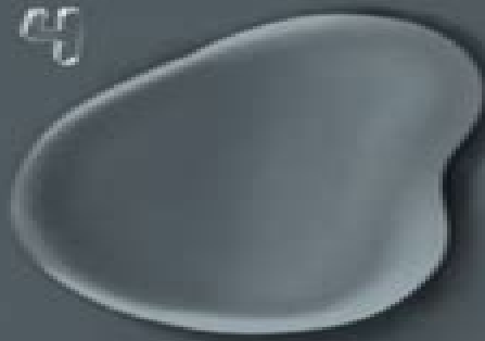
add highlights around the edges