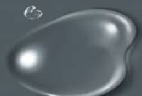
add brightest highlights