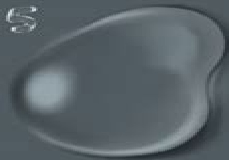
Refining & Blending