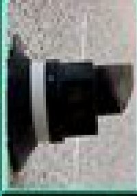
HEAT-RESISTANT WALL THIMBLE