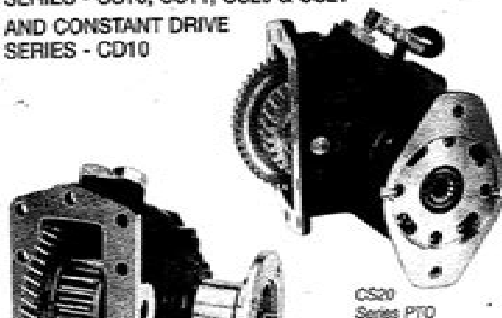
CS20 Series PTO

FOR CLUTCH SHIFT SERIES - CS10, CS11, CS20 & CS21 AND CONSTANT DRIVE SERIES - CD10