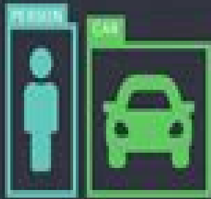
1. IMAGE SEGMENTATION