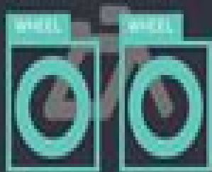
5. PATTERN DETECTION