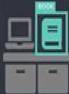
2. OBJECT DETECTION