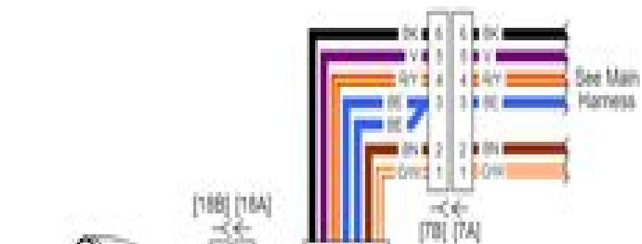
Dual Stop Lamp (DCM)