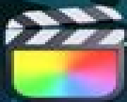
Final Cut Pro