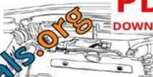
Fig. 30: Identifying Breather Tube To Camshaft Cover (1 Of 2)