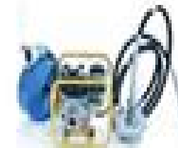
SUBMERSIBLE FLEXIBLE SHAFT PUMP