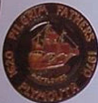
A studio pottery plaque commemorating the 1970 Pilgrimage to Plymouth, 1970, 10in (25.5cm) diam.