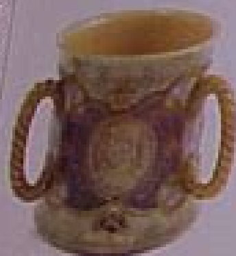
A Royal Doulton glazed stoneware mug commemorating the life of Lord Nelson, with three tape-effect handles, c1900, 8 1/2in (21.5cm) high.