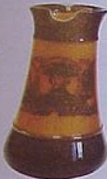
A Royal Doulton salt-glazed jug commemorating the life of Lord Nelson, with a lion and crown, c1900, 10 1/2in (26.7cm) high.