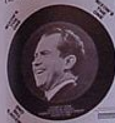
A Richard Nixon presidential campaign portrait mug, the reverse printed with words, 1968.