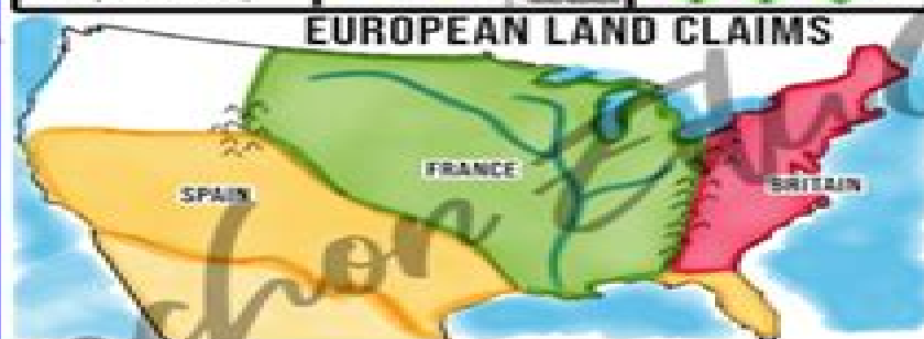
EUROPEAN LAND CLAIMS