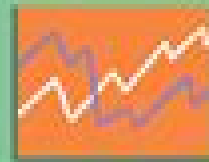
Recent Price Patterns