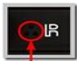
Remote Control Receiver

You can turn on or off the unit by Infrared remote control, Start /Pause/Next/Up in Playback mode, auto search and store the stations in radio mode, turn up/down volume.