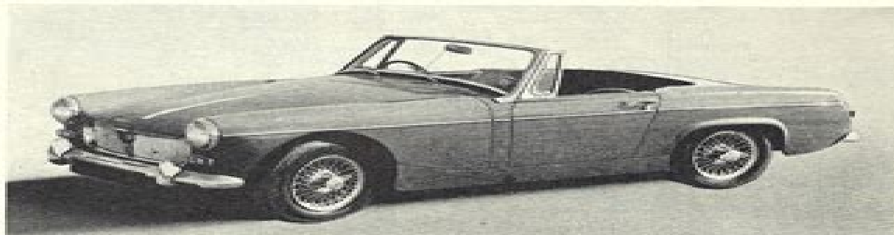
DISTINGUISHING FEATURES: Swivelling quarter lights and wind-up windows identify the Mark II cars in latest form, although styling in general follows the lines of previous models

All rights reserved. This Service Data Sheet is compiled by the technical staff of Motor Trader from information made available by the vehicle manufacturers and from our own experience. It is the copyright of this journal, and may not be reproduced, in whole or in part, without permission. While care is taken to ensure accuracy we do not accept responsibility for errors or omissions.