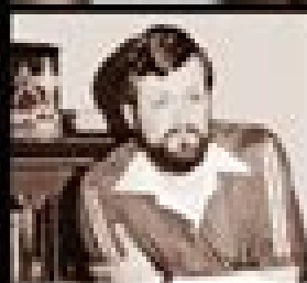
UFOs Revealed! Earth Says Say NASA Man The Australian Today, February 11, 1981, page 1