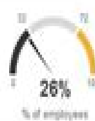
Employees that would Consider Re Employment