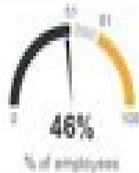
Employees that will Refer Company to Friends/Family