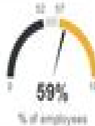
Employees that are Treated Impartially