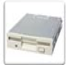
Floppy Disk Drive