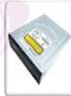
Optical Disk Drive