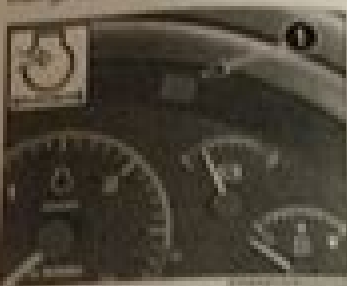
1. AIR FILTER RESTRICTION WARNING LAMP

On start up the air filter restriction warning lamp should illuminate and then go out after 3 seconds.