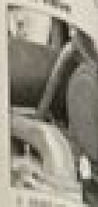
1. DUST VALVE

Under most conditions, the dust valve will close.