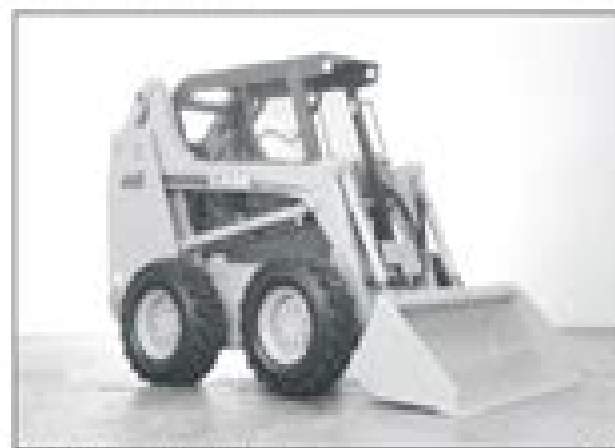
Always use proper operation of skid steer loader.

This unit first became available in 2005.