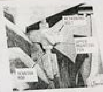
Tension Rod with Two Lock Nuts