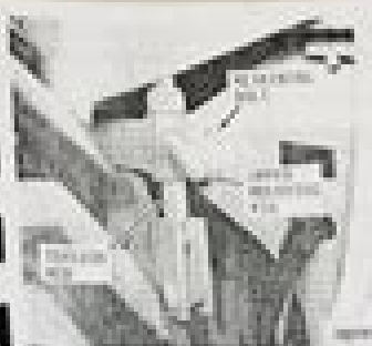
Tension Rod with Self-Locking Nut

NOTE: Cab Models: You must remove the rear floor plate and the rear panel under the rear window.