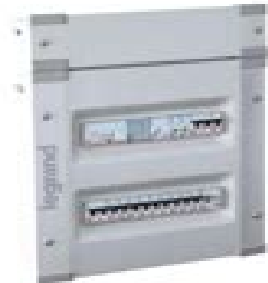
Fluory IP20 DB with Cable End Box