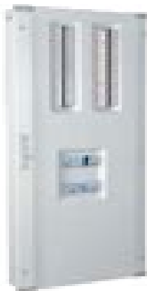
VTPN MCCB IP20 DB