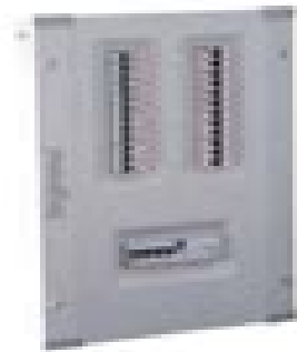
VTPN IP20 DB