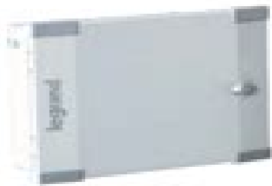
SPN IP43 DB with Metal Door