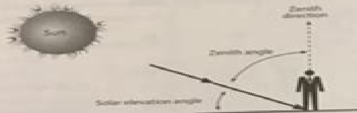
Figure 2-5. Defining angles.

Since we can assume that the Sun's rays strike Earth in straight, parallel paths, we see that the zenith angle of any location is the same as the number of degrees separating the location and the place receiving direct solar rays. Notice in Figure 2-6 that the zenith angle A at 40^\circ N is the same as the latitude difference between 40^\circ N and the subsolar point (where the Sun's rays strike directly — 23.5^\circ S here).