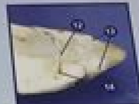
Examine the snout of the specimen.