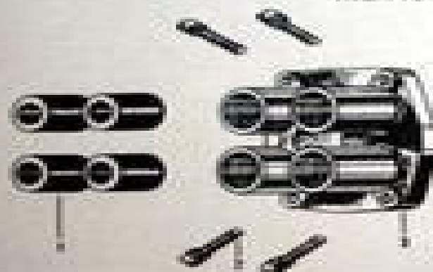
Kit No. 10-52935