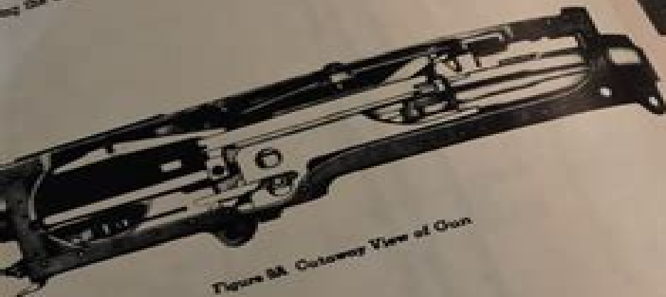
Figure 9A. Cutaway View of Gun.

When the burning powder violently generates gas which expands the gas case and barrel starts a tremendous pressure. This pressure at the moment is still within the cartridge case and which has a thrusting force of five tons pushes the bullet out of the barrel. This thrusting force of five tons pushes the chamber toward the rear. Such thrusting the bolt positively locked against the rear of the cartridge at the