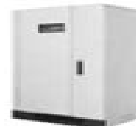
EDP750 L (60 - 250 kVA)