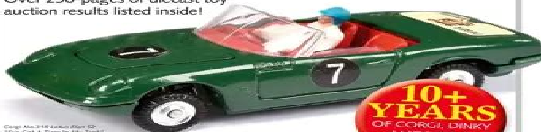
Corgi No. 7118 Lotus Elan '62 "Pete and A. Tiger" in "My Bank", sold for £1500.

Over 250-pages of diecast toy auction results listed inside!