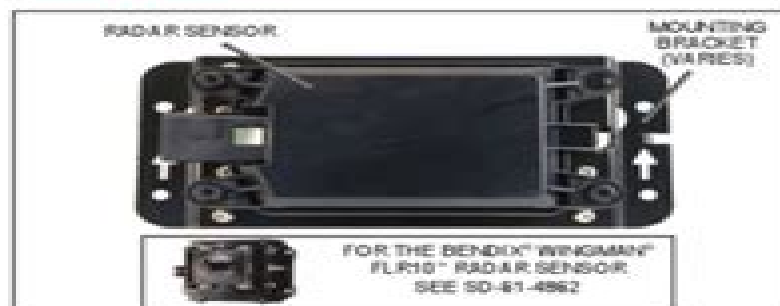
FIGURE 1 - BENDIX® WINGMAN® FLR20™ RADAR SENSOR AND COVER

The driver is always responsible for the control and safe operation of the vehicle at all times. The Bendix Wingman Advanced system does not replace the need for a skilled, alert professional driver, reacting appropriately and in a timely manner, and using safe driving practices.