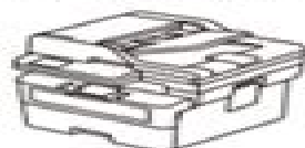
Toner Cartridge and Drum Unit Assembly

Remove the protective tape or film covering the machine and the supplies.