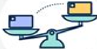
Credit Card Balance Transfer