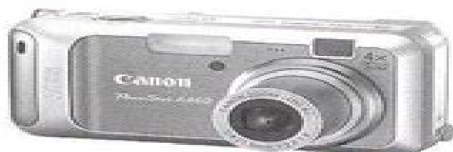
Photo of PowerShot A460