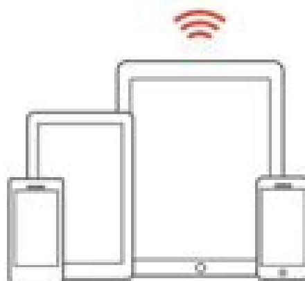
Apple iOS, Android or Kindle mobile device connected to your network