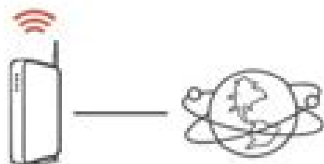
Wi-Fi router and Internet connection

Make sure you have the following items in working order: