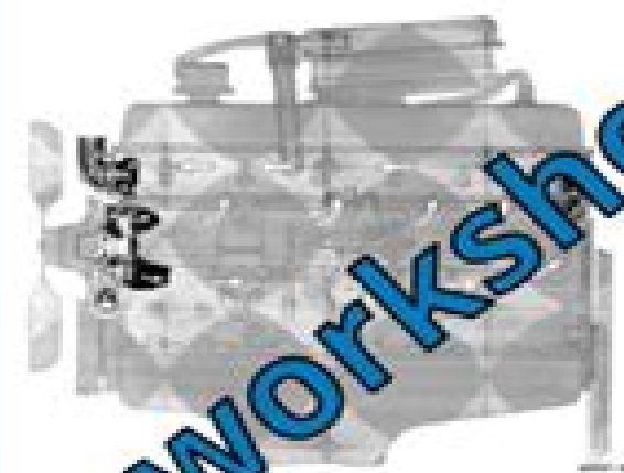
FIG. 8—Engine Control System

connecting tubes to the carburetor. The carburetor is connected to the engine by the carburetor. The carburetor is connected to the engine by the carburetor. The carburetor is connected to the engine by the carburetor.