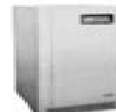
EDP700Plus (50 - 80 kVA)