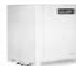
EDP700Plus (12 - 30 kVA)

Temperature compensated charging eliminates the possibility of thermal runaway.