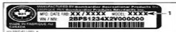
TYPICAL — VEHICLE IDENTIFICATION NUMBER LABEL 1. Model number