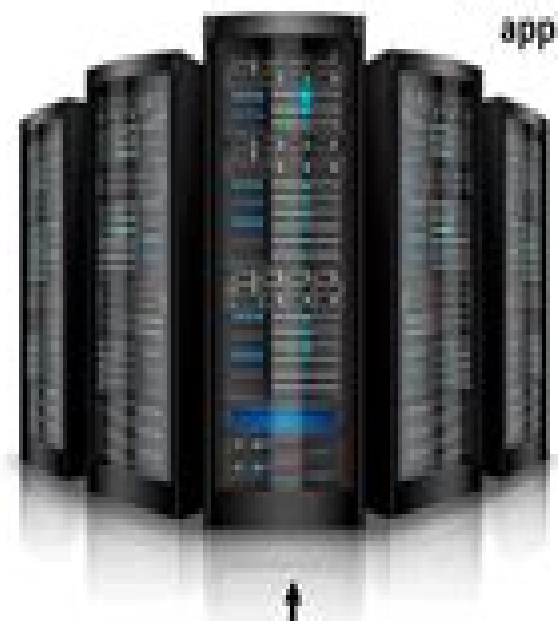
Client: Mainframe applications.