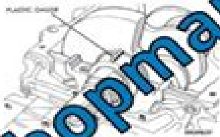
Fig. 4 Measure Crankshaft Journal O.D.

CAUTION: Do not rotate crankshaft or the plunger will be damaged.