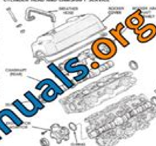
Fig. 1 Cylinder Head/Camshaft Valves