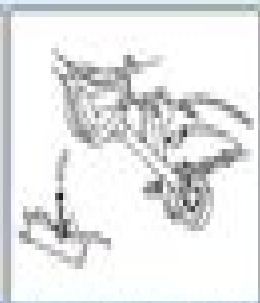
100 DRIVE SHAFT, FRONT WHEEL, DRIVE, DIFFERENTIAL, AND DRIVE SHAFT