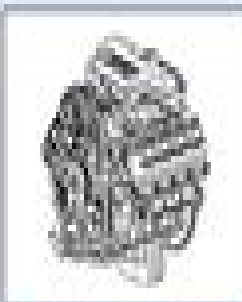
6000 2.0L, 2000 ENGINE, ENGINE