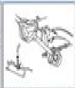
6000 DRIVE SHAFT, FRONT WHEEL, DRIVE, DIFFERENTIAL, AND DRIVE SHAFT