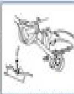
3000 DRIVE SHAFT, FRONT WHEEL, DRIVE, DIFFERENTIAL, AND DRIVE SHAFT