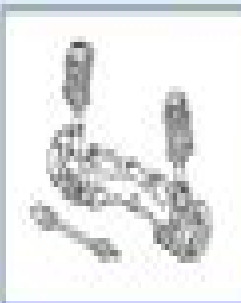
1 DRIVE SHAFT/ENGINE