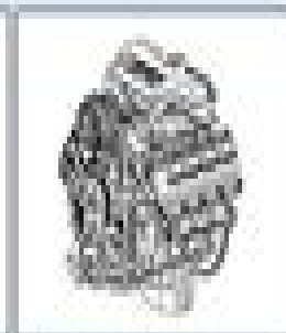
5 CHASSIS, 2.0L, 2000