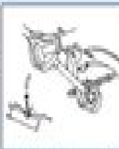
5000 DRIVE SHAFT, FRONT WHEEL, DRIVE, DIFFERENTIAL, AND DRIVE SHAFT