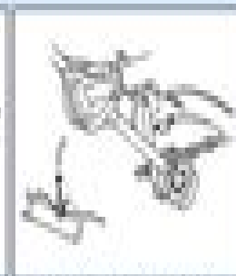
4000 DRIVE SHAFT, FRONT WHEEL, DRIVE, DIFFERENTIAL, AND DRIVE SHAFT