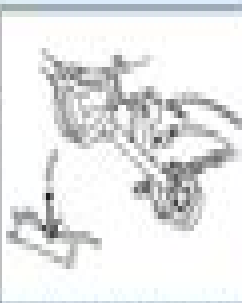
2000 DRIVE SHAFT, FRONT WHEEL, DRIVE, DIFFERENTIAL, AND DRIVE SHAFT