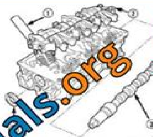
Fig. 186: Spark Plug Tube, Rocker Arm Assembly, Camshaft & Seal