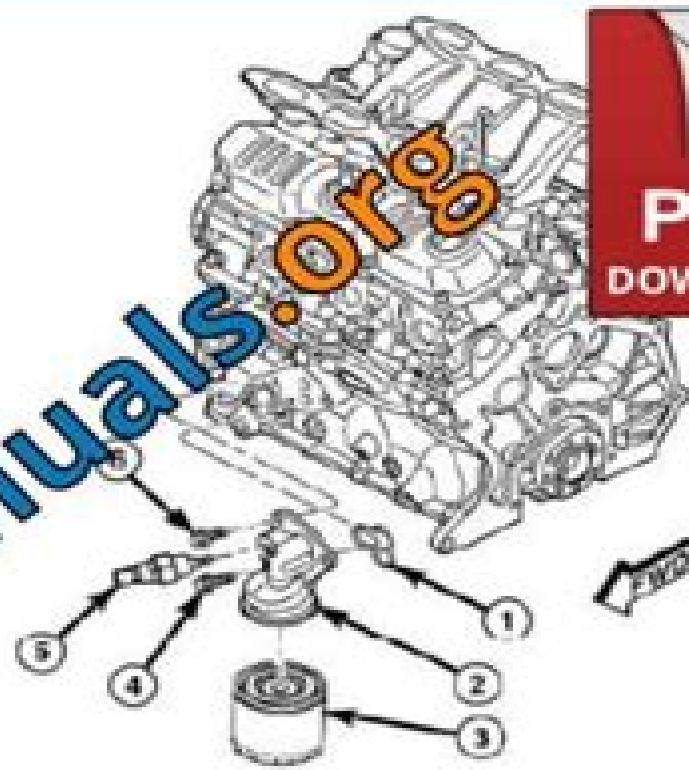
Fig. 156: Removing/Installing Oil Filter Adapter