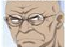
Ethanbaron V. Nusjuro