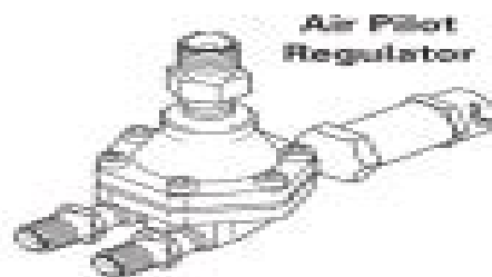
Air Pilot Regulator

IMPORTANT: Read and follow all instructions and safety precautions before using this equipment. Retain for future reference.