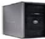
Mini Tower Computer