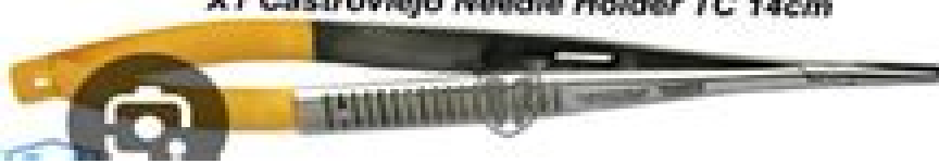
X1 Castroviejo Needle Holder TC 14cm