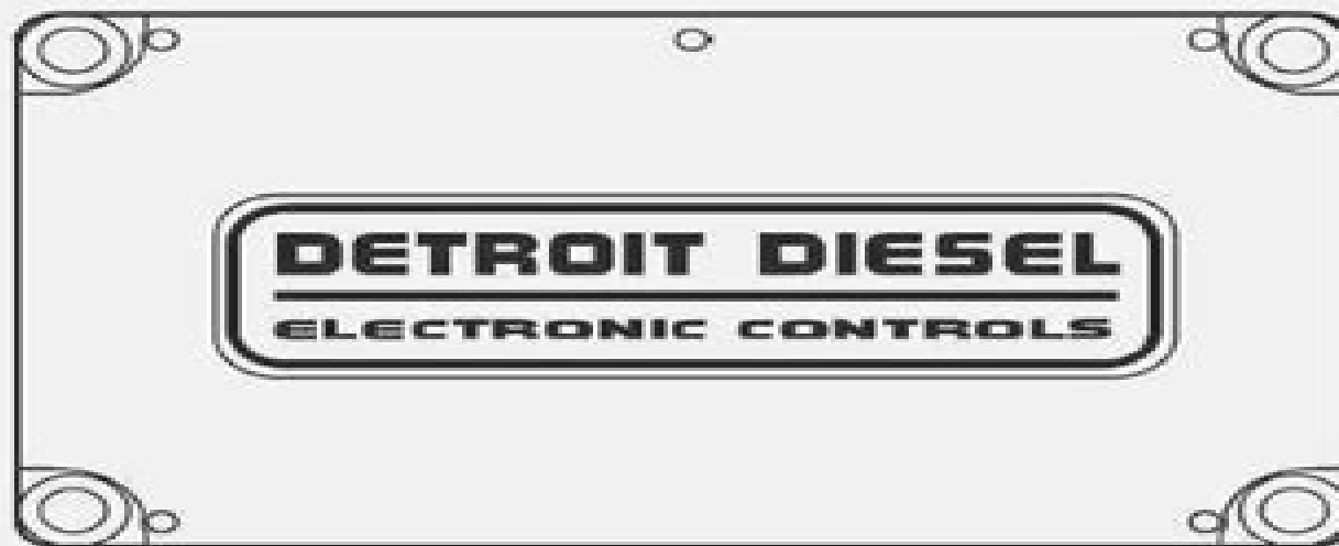
DDEC III / IV ECM FRONT SIDE