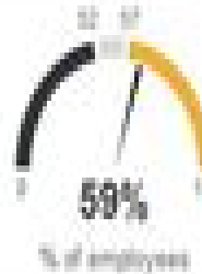
Employees that are Treated Impartially