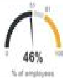
Employees that will Refer Company to Friends/Family