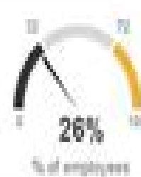
Employees that would Consider Re Employment