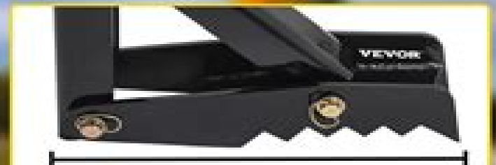
Plate thickness: 1/2 in